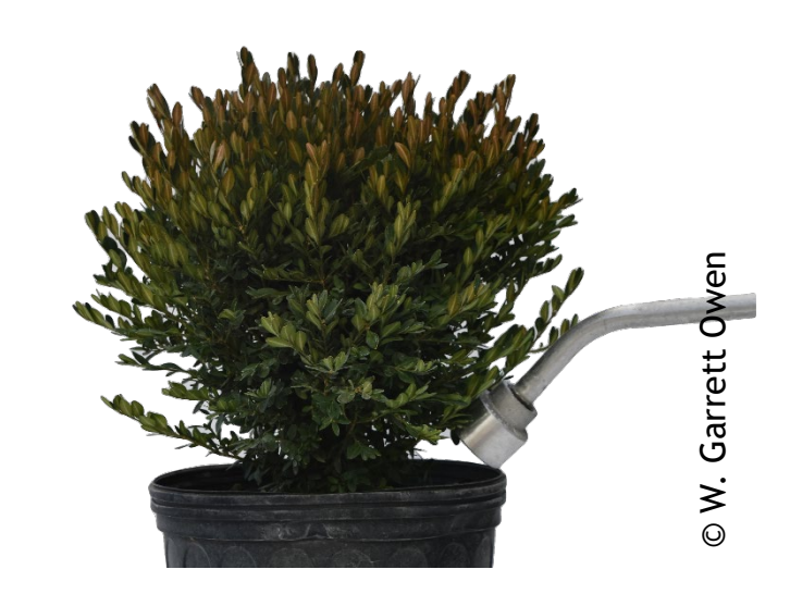
Figure 2. Irrigate 3 to 5 representative plants or the entire crop to container capacity.