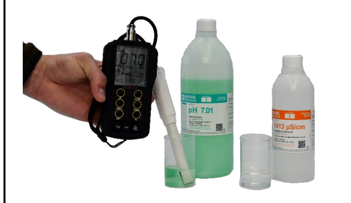
Figure 3. While waiting 30 minutes to 2 hours, calibrate the pH/EC meter.