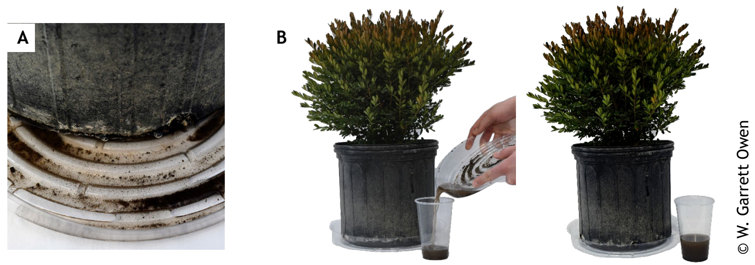
Figure 6. Leachate will collect in the saucer (A). Collect leachate from each saucer for pH and EC evaluation (B).