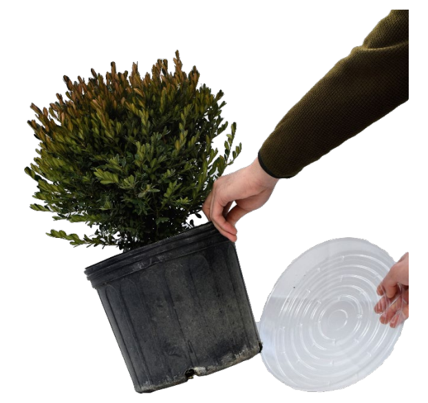
Figure 4. Place a plastic collection saucer under each container to be sampled.