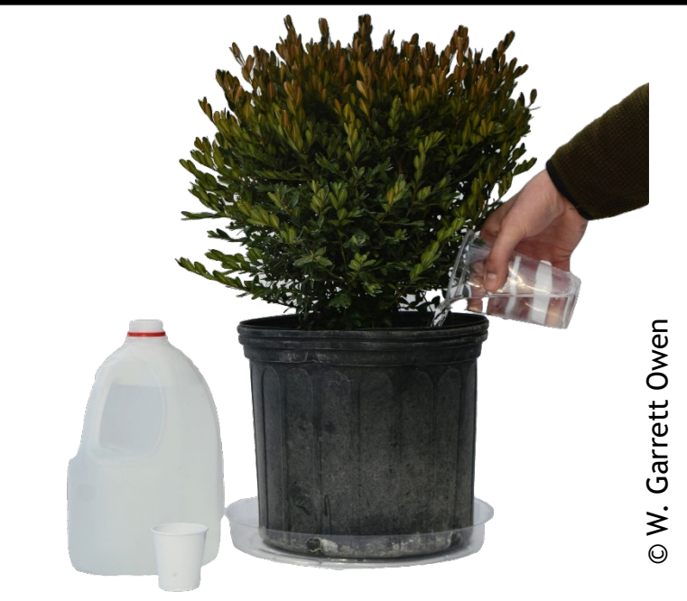
Figure 5. Pour distilled water over the substrate surface, circling the plant.

By following these steps, growers will be able to determine the substrate pH and EC of their large containerized crop(s); mitigate nutritional disorders; and determine if correction procedures are required.